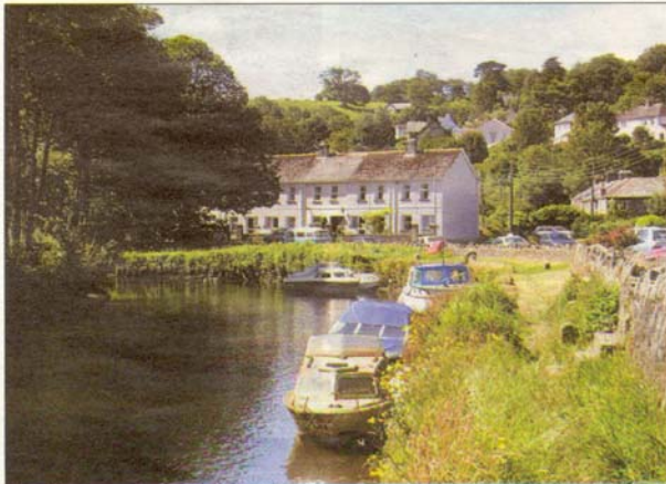
Cornish cream: Lostwithiel is a tiny haven for antique-hunters (No 14)

ARCHITECTURAL SALVAGE ■ ANTIQUARIAN BOOK SELLERS ■ ANTIQUE FURNITURE ANTIQUE TOWNS ■ COLLECTABLE OUTLETS ■ GLASS DEALERS ■ GLASS DESIGNERS